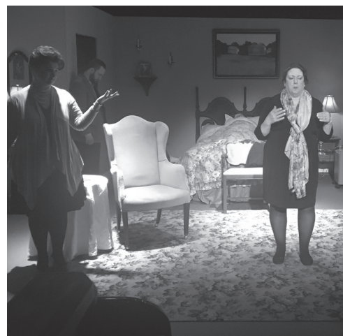
Three Tall Women