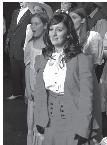
Annie Get Your Gun