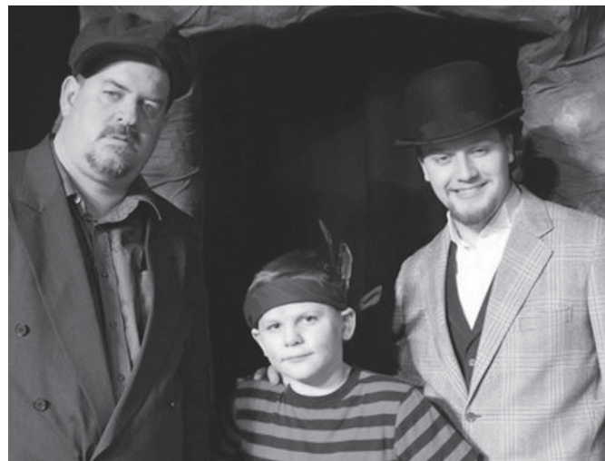
Ransom of Red Chief