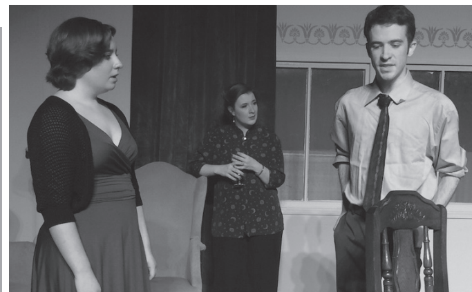
Murder on the Nile